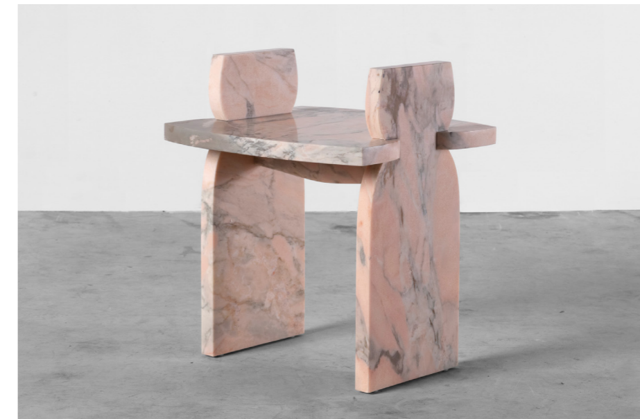
'BARAAHP' Side Table, L:43.5 x W:41 x H:51cm, Reclaimed Rosso Aurora