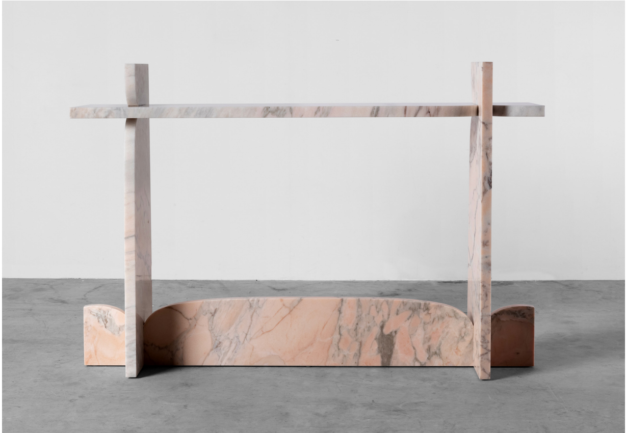
'BARAAHP' Console, L:120.5 x W:30 x H:81cm, Reclaimed Rosso Aurora

'Between a Rock and a Hard Place' is a series by Netherlands-based designer Maria Tyakina, whose practice is driven by a fascination between objects, people, and the physical world. BARAAHP finds a dynamic equilibrium between fluid and solid forms, exploring subtle complexities of human gestures and postures.