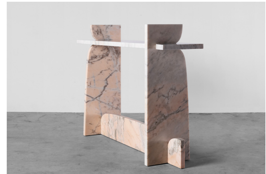
'BARAAHP' Console, L:120.5 x W:30 x H:81cm, Reclaimed Rosso Aurora