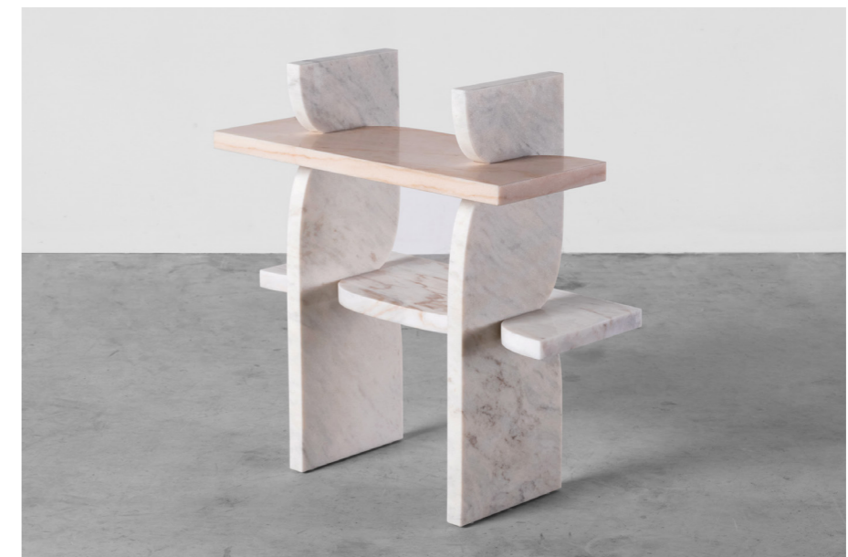
'BARAAHP' Shelf, L:59 x W:32 x H:64cm, Reclaimed Rosso Aurora