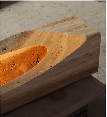
The collection was crafted from Roman travertine and portrays an intimate knowledge of materiality.